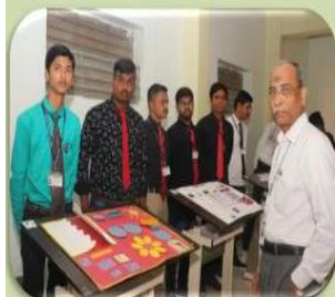
Principal visit to Exhibition