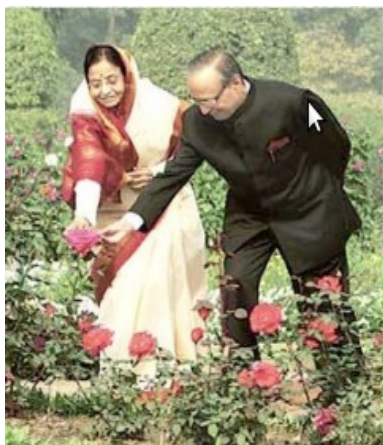
Hon'ble Smt. Pratibhatai Patil & Hon'ble Dr. Devisinghji Shekhawat