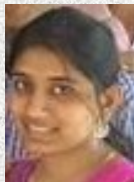
Third Topper (9.04)