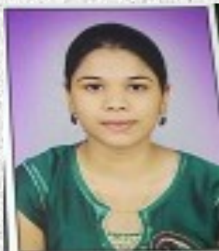
First Topper (9)