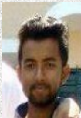
Third Topper (9)