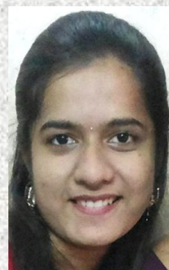
Third Topper (CGPA-8.7)