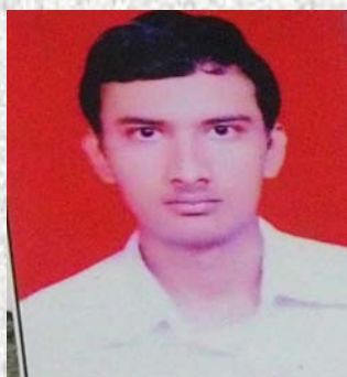
Third Topper (CGPA-8.7)