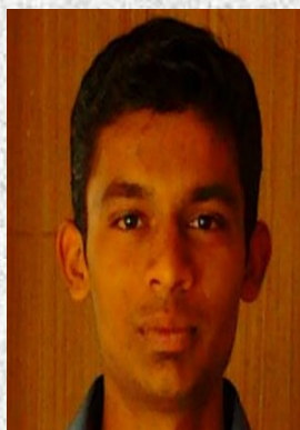
Third Topper (9)