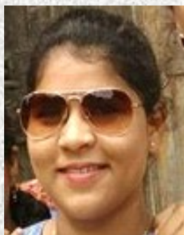
Second Topper (9.04)