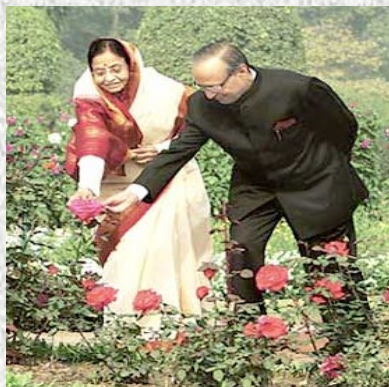
Hon'ble Smt. Pratibhatai Patil & Hon'ble Dr. Devisinghji Shekhawat