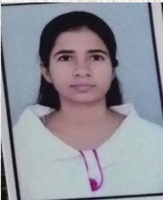
Third Topper (8.94)