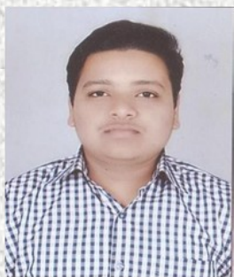
First Topper (9.09)