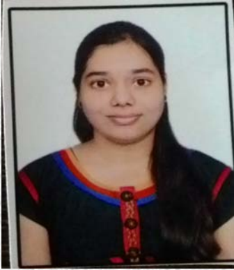
First Topper (9.35)