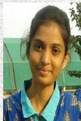
Third Topper (9)