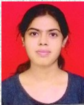
First Topper (9)