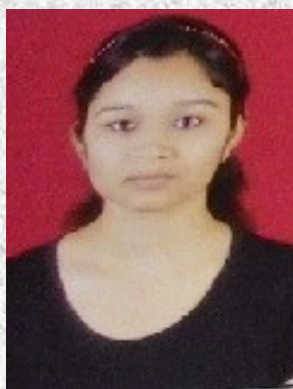
Second Topper (CGPA -8.9)