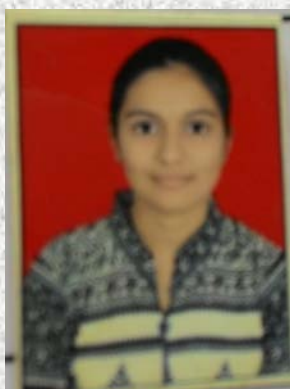
Third Topper (CGPA-8.7)