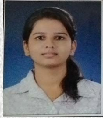
Second Topper (9.26)