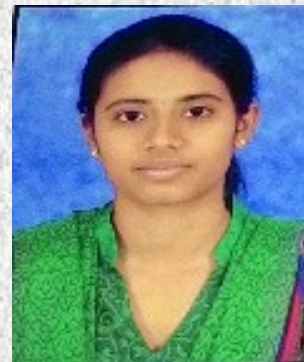
First Topper (9)