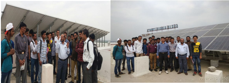
Visit to Solar Panel Station of SSBT COET Bambhori

विभागात चालू झाले 1. Solar Panel Installation Technician 2. Field Technician-UPS and Inverter