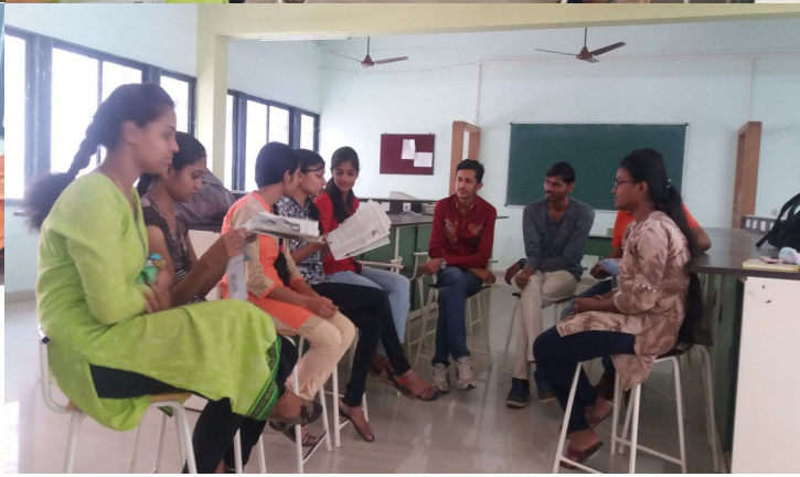
ISE I & II Test E&TC Students