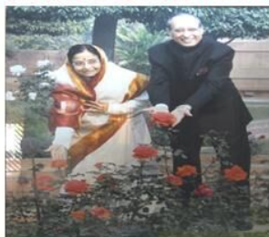
Smt. Pratibhatai Patil Former President of India & Dr. D. R. Shekhawat Former Chairman