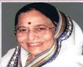
Hon. Smt. Pratibhatai Patil Former President of India & Founder of the College

To provide conducive environment for preparing competent, value added and patriotic engineers of integrity of par excellence to meet global standards for societal Development.