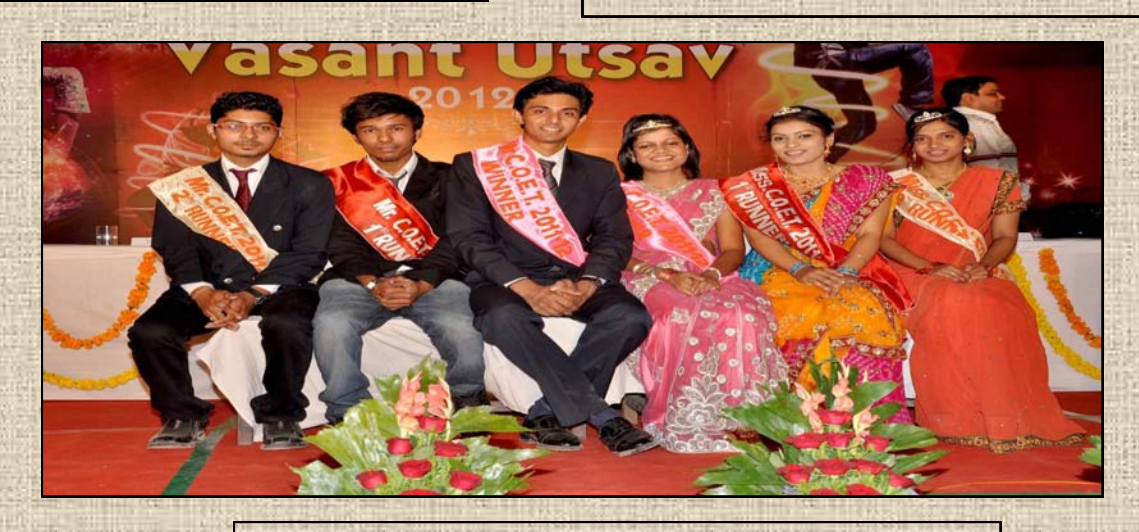
PERSONALITY CONTEST WINNERS