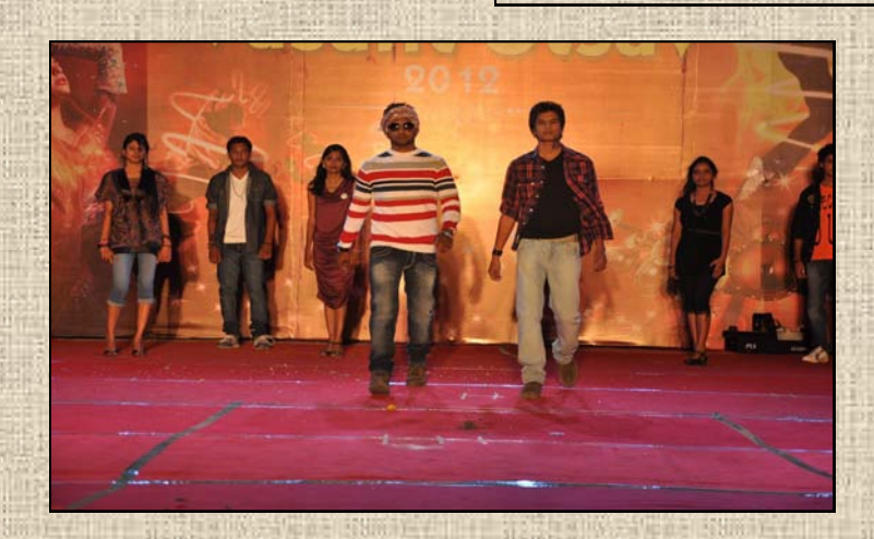
WESTERN FASHION SHOW