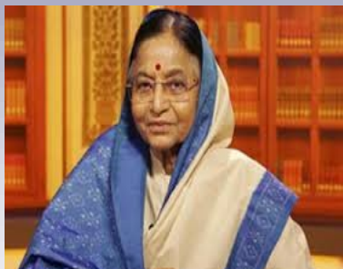
Hon. Sau. Pratibhatai D. Patil Former President Of India & Founder of the College