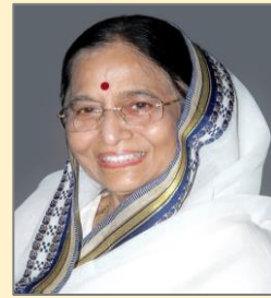
Smt. Pratibha Devising Patil (Former President of India) Founder Chairperson Shrama Sadhana Bombay Trust